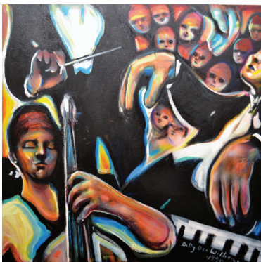
Etude: 36 x 36 Oil on Canvas

"Billy Dee Williams grew up in the Harlem section of New York City in a family that nurtured artistic expression in all forms. At his mother's urging, at the young age of seven, Billy Dee made his acting debut on Broadway in the FIREBRAND OF FLORENCE, starring Lotte Lenya. Billy attended public school including the High School of Music and Art. He was awarded the prestigious Hallgarten Award Scholarship to attend the National Academy of Fine Arts and Design. In order to earn money to buy paint and canvas Billy, remembering his positive stage experience as a youngster, returned to acting, contrary to the strong protests of his art professors. Billy quickly distinguished himself in the performing arts and despite the often-arduous schedules managed to keep his love of painting an integral part of his life." Source: silverscreenartist.com